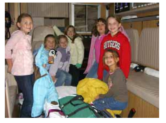
November, 2007: After learning basic first aid skills Fair Haven Girl Scouts toured one of our ambulances.