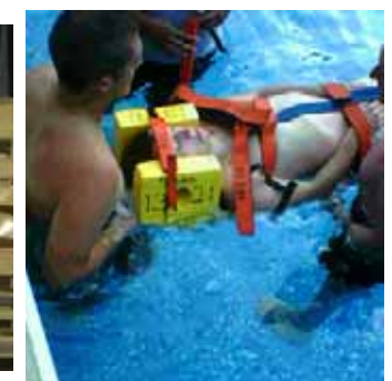
In July, First Aiders participated in a water rescue drill. This "patient" is immobilized using a long board and spider straps.