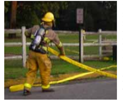
On a sultry 80 degree night in July, dedicated firefighters donned their turnout gear and spent hours practicing hose and water techniques at Sickles School. These drills are essential to ensuring FHFD is ready for any emergency in town.

On April 6, at the 5th Annual Scouts Fight Cancer Pancake Breakfast, Fire Police volunteers spent over 5 hours helping breakfast-goers park safely. As they do for fire and emergency calls, they were the first to arrive and the last to leave.