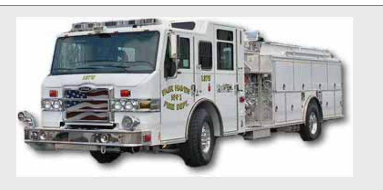
We welcome the newest member of our fleet, Engine 1375 (See page 6!)

I would like to take this opportunity to congratulate all of the other 2008 Officers of not only the Fire Department, but First Aid, Fire Police, Water Rescue and Auxiliary (see photos). Yes, there are many volunteer organizations that fall under the umbrella of the Fire Department. Each of these is an important part of the Fire Department with its own set of officers and duties. For those of you who may have had the misfortune to call upon us it may seem as though "just a bunch of people" showed up at your home or business. Indeed, this "bunch" works in unison as a team to resolve your emergency—this starts with each volunteer taking an "Oath of Duty" to the Fire Department and community and rigorously preparing for (See "Chief's Report" on page 2, column 2)