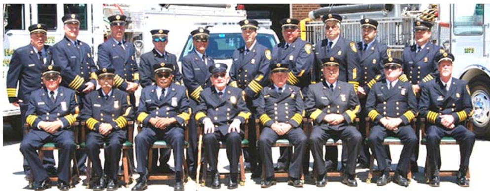
Five decades of Ex Chiefs pose for a photo at our recent 110th celebration

A message for parents: There is one more thing you can do to help us. Every October the Fire Department provides a Fire Safety lesson to Fair Haven students from pre-K to 5 th grade. We teach them what to do in the event of an emergency. Every year we ask the students if they conduct fire drills at home. Only a few children raise their hands. My goal: This October, I would like to see ALL of the students raise their hands when we ask them if their families conduct drills at home. Thank you for your continued support. Please email me at chief@fhfd.org if you have any questions or concerns.