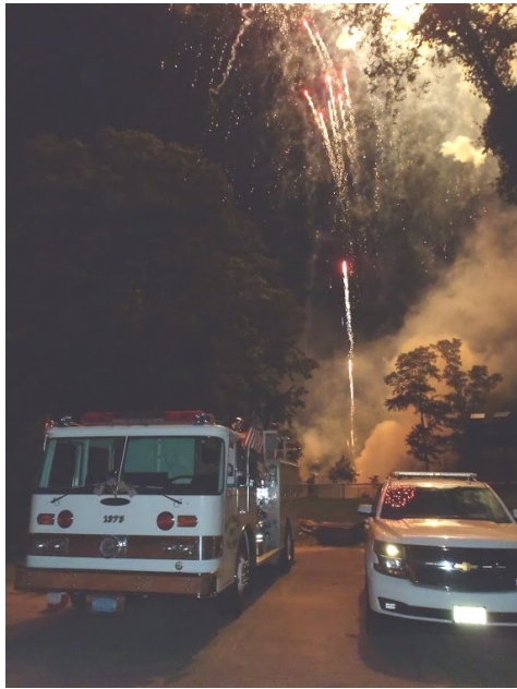
June 15—Fair Haven Day. Firefighters stood by at Fair Haven Fields to make sure everyone was safe during the fireworks while the First Aid Squad provided EMS support.