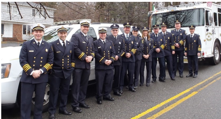
March 10— Rumson St. Patrick's Day Parade