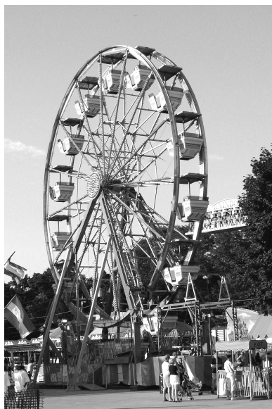
August— The Biggest Firemen's Fair Yet