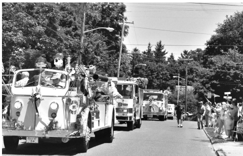
June — Spectacular 100th Anniversary Parade!