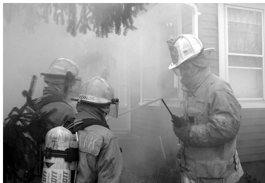
January— Fire Dept. conducts "Live burn" drill at a house scheduled for demolition