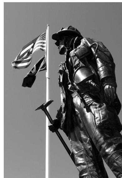
March — Dedication of Memorial Statue