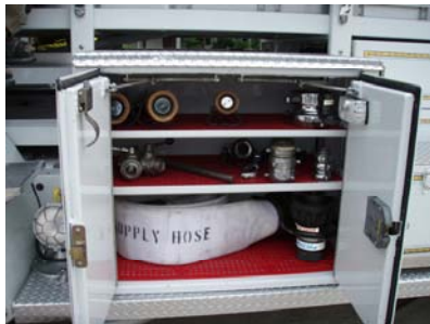
This meticulous attention to detail ensures that our volunteers can quickly access any needed equipment and fire fighting tools at an emergency.