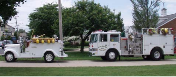
Young and Old mingle: Here, a vintage FHFD Fire Patrol truck is parked in front of 1373, awaiting the hoses to fire up.