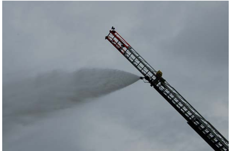
An aerial truck from Long Branch takes aim.