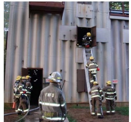
Nick is also a talented photographer and has documented many FHFD moments. Here, he got behind the lens to capture firefighters during an intense smoke drill.