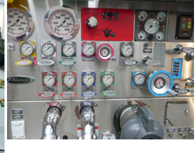
⇒ Want to learn more about 1375? Go to www.fhfd.org for more information and photos!