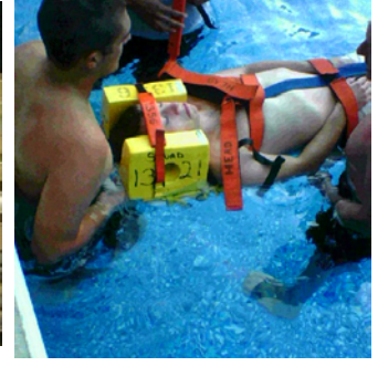
In July, First Aiders participated in a water rescue drill. This "patient" is immobilized using a long board and spider straps.