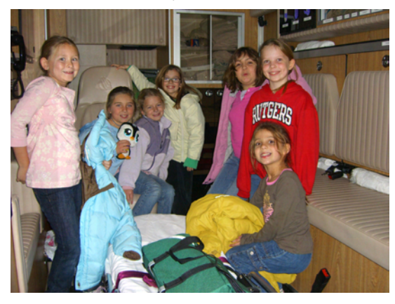
November, 2007: After learning basic first aid skills Fair Haven Girl Scouts toured one of our ambulances.